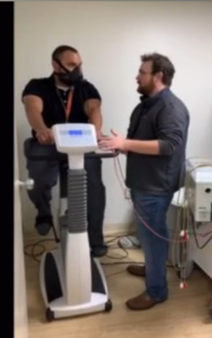
Schedule next visit